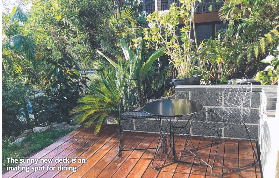
The sunny new deck is an inviting spot for dining.