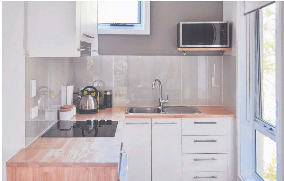
New timber benchtops and a streamlined cooktop and oven update the compact kitchen.